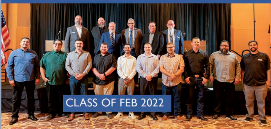
CLASS OF FEB 2022