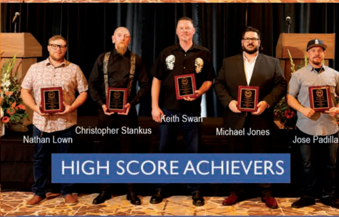
HIGH SCORE ACHIEVERS