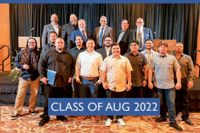
CLASS OF AUG 2022