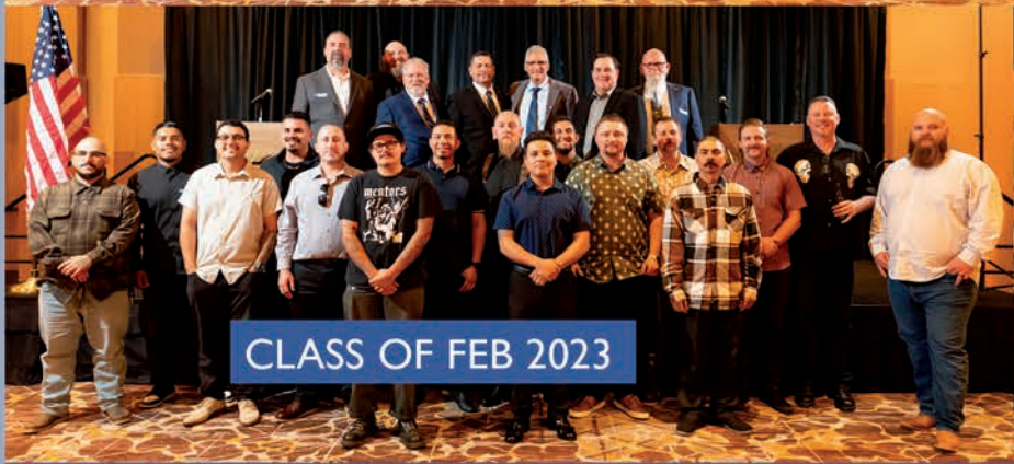
CLASS OF FEB 2023