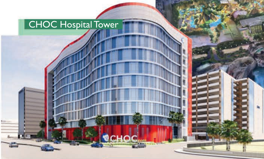
CHOC Hospital Tower