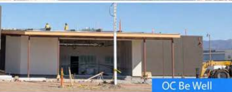
OC Be Well