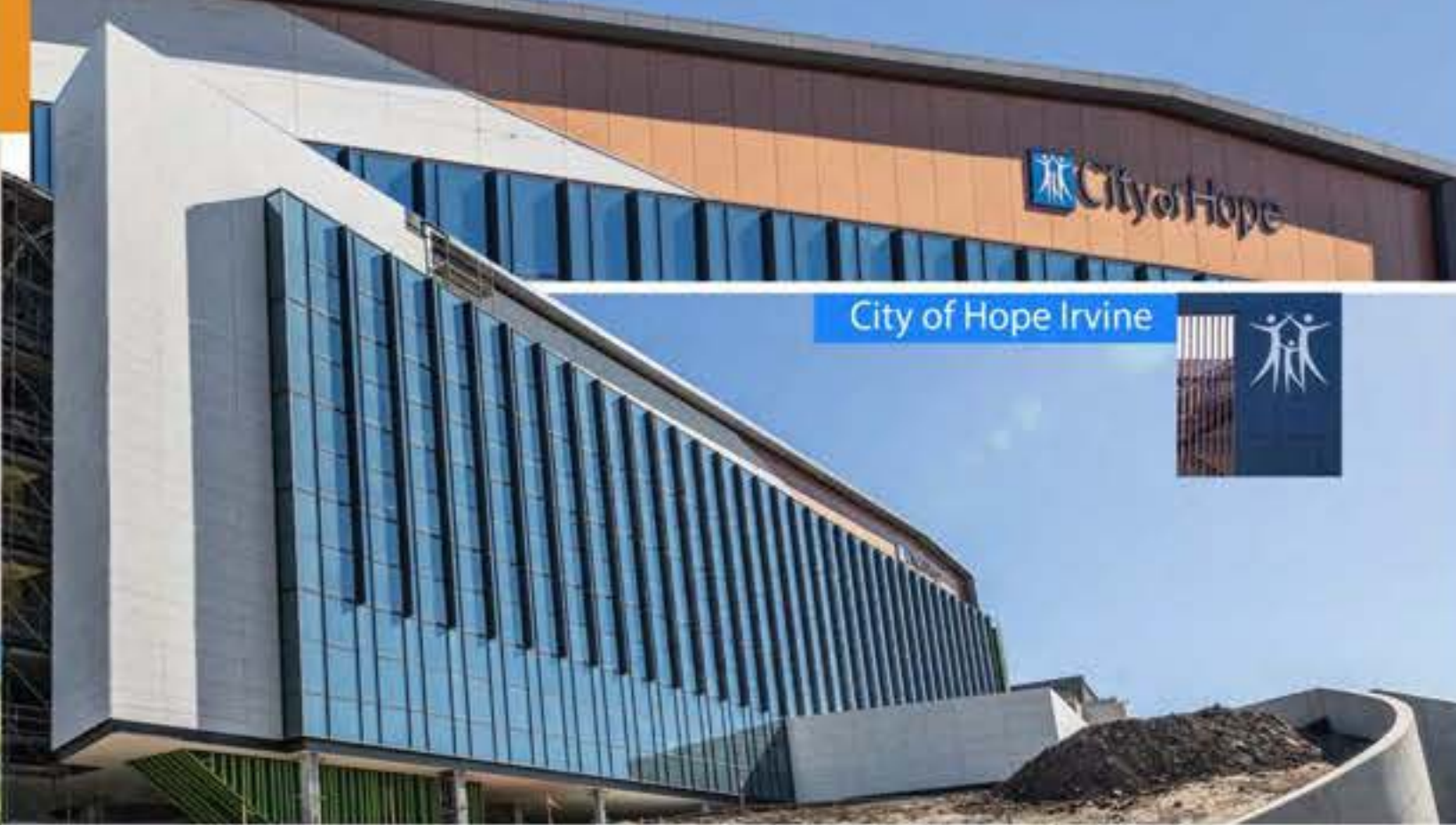
City of Hope Irvine